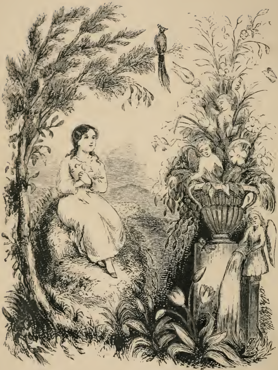
Earth and air seemed filled with beauty.